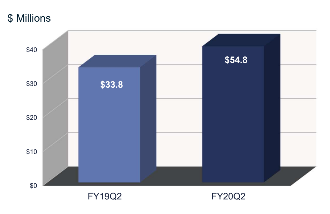
Reflects S3 contribution of $18.7 million and organic growth across the Company