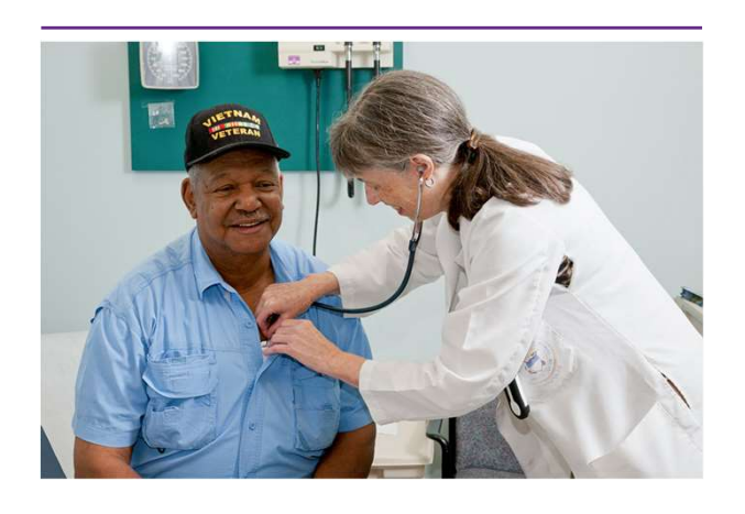
Human Services and Solutions